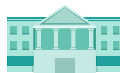
visiting museums, galleries or exhibitions