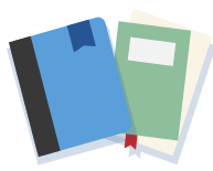
books, magazines or newspapers