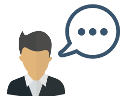
speaking to people