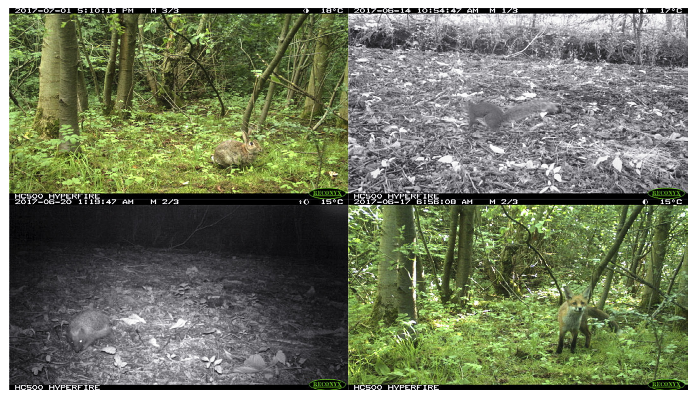
Figure 4 Animals observed with camera traps set up by Belmont Community School students; clockwise from top left: rabbit, grey squirrel, red fox, and hedgehog – these photos have been uploaded to MammalWeb for classification by other citizen scientists; the greyscale images were taken at night or in low-light conditions using the camera's infrared flash

identifying game (using models of wildlife scat samples on loan from the British Ecological Society) was particularly successful in engaging people of different ages, while their mammal Easter egg hunt absorbed younger children. The team adapted their activities and have since contributed to several community events, including engaging over 2000 people in one day at Durham University's public Celebrate Science festival in October 2017 (Figure 6). In addition to demonstrating the use of camera traps and running the poo game at this festival, the students showed and explained an activity they developed where