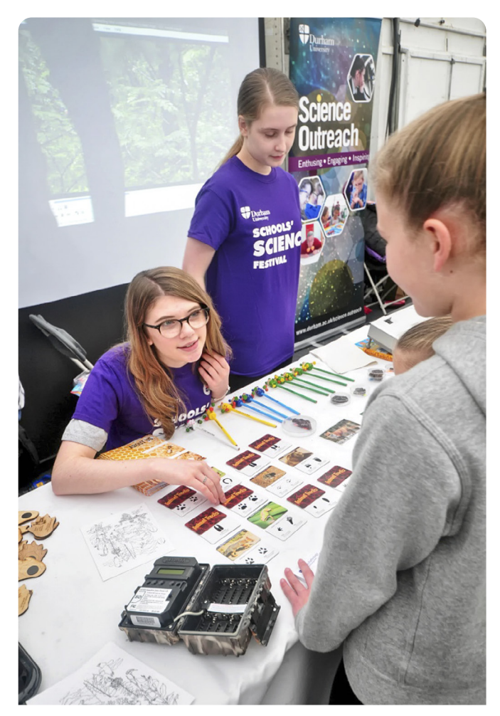
Figure 6 Student ecological ambassadors engaging visitors at the Celebrate Science festival in October 2017