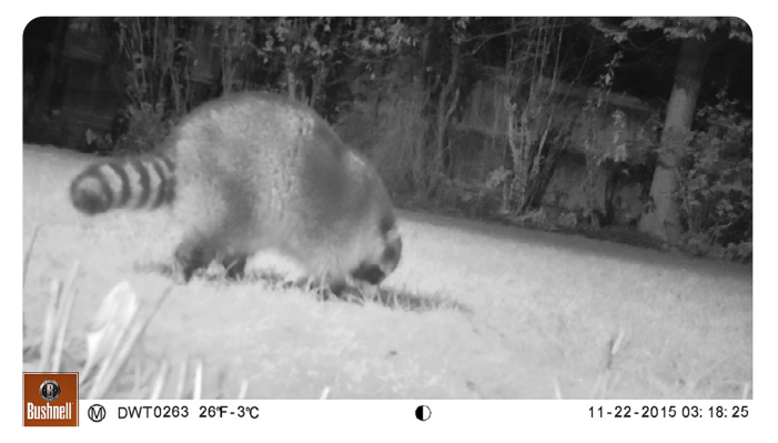
Figure 2 A non-native raccoon ( Procyon lotor ) as imaged by a motion-sensing camera trap operated by a MammalWeb citizen scientist

citizen scientists has led to civic engagement with tangible management outcomes. For instance, one of us (Roland Ascroft) used camera traps on a reclaimed colliery site at New Brancepeth (in County Durham, England), gathering over 74000 images by autumn 2018. In addition to submitting these images to MammalWeb, he found 12 species of wild mammals, including roe deer ( Capreolus capreolus ), which reproduce annually on site. These results are now informing the planning of a local nature reserve in the area.