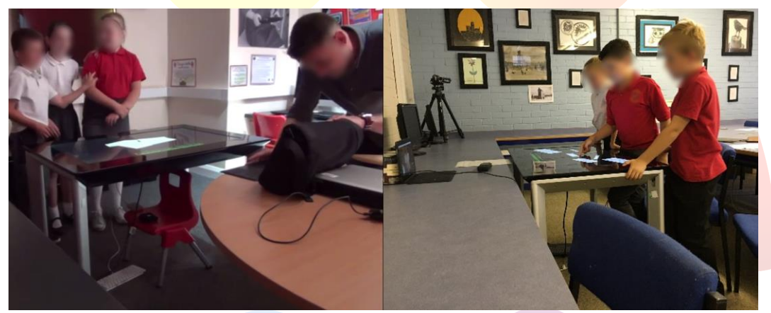
Synergynet software supporting simultaneous collaboration in two schools, 300 miles apart.

SynergyNet project: preliminary pilot data collection was completed in June 2016. This successfully proved the technology was stable and learners in two primary schools could collaborate simultaneously with each other. One article has already been published and more are planned. Current focus is on developing a Leverhulme grant application to be submitted by the end of April and on a subsequent round of data collection in June/July 2017.