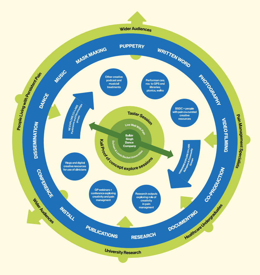
Figure 1. Summary of the Unmasking Pain Activity Diagram

A series of creative dissemination events were launched that included exhibitions, installations, performances, presentations, podcasts and lectures. Venues included shopping centres, GP surgeries and universities. The dissemination events intended to inform pain management specialists with an ambition to bring a creative interpretation of LWWP's Ten Footsteps resources to practitioners.