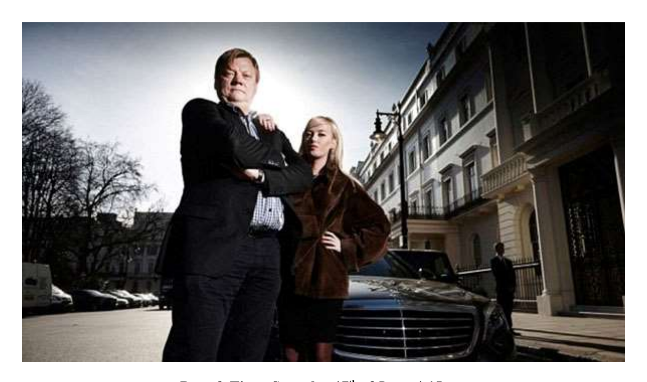
Date & Time: Saturday 17th of June, 4:15 pm