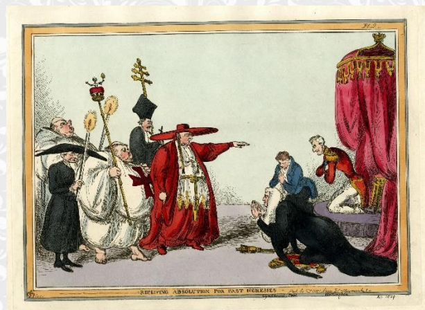
Image Credit William Heath, Receiving Absolution for Past Heresies, published by Thomas McLean, 1829

It would be easy to dismiss the idea of Wellington as a crypto-Catholic as the result of mixed resentment and paranoia, but the picture is more complex. This leitmotif is strictly connected with the fear for an attack at the balance of the constitution; to make matters worse, constitutional change happened at a moment when a soldier was leading the king's government, and under his direction. In these exceptional circumstances, Catholicism could be once more a byword for absolute rule, or dictatorship: the ghost of a centuries-old polemic was not yet ready to be laid to rest.