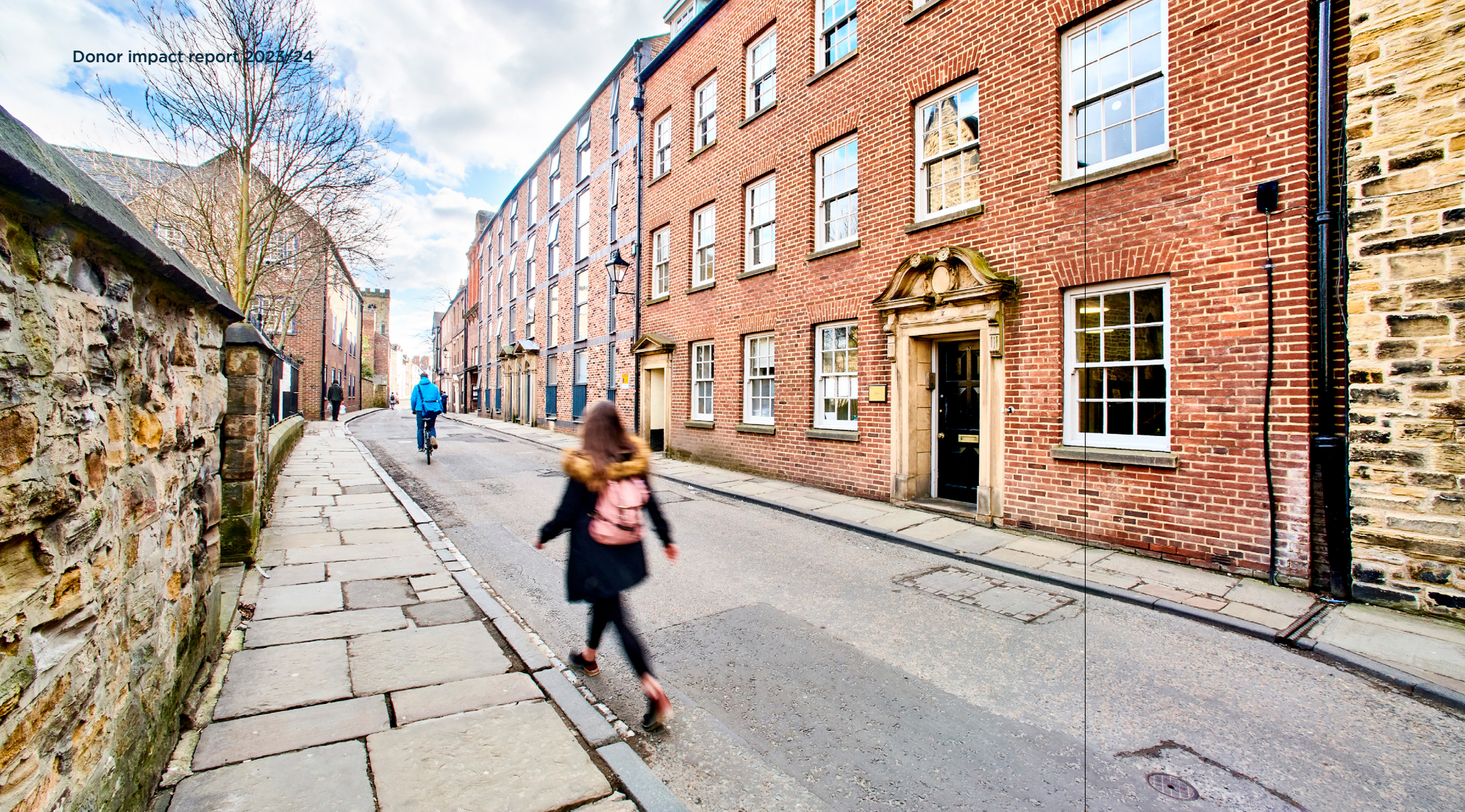
The Department of History.