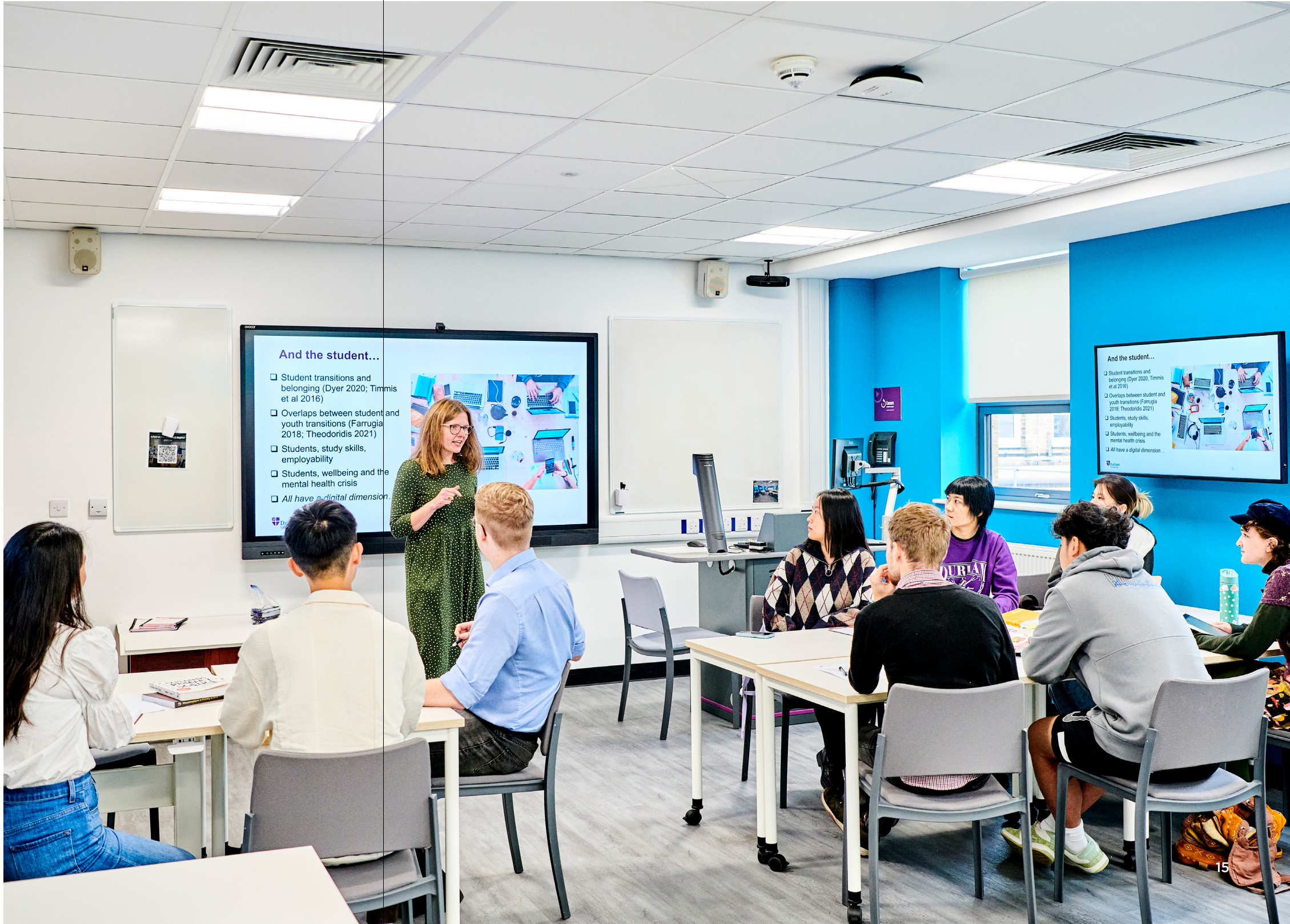
Post-graduate students at Durham.

Read more about the Master of Social Work: durham.ac.uk/master-of-social-work