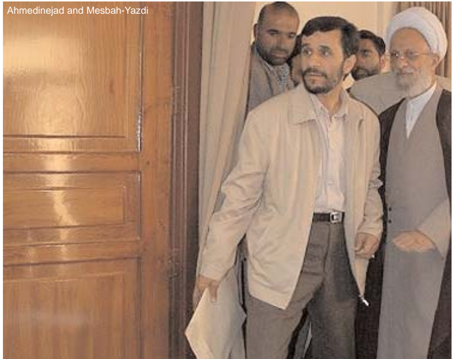
Ahmedinejad and Mesbah-Yazdi

the most forceful and inflexible kind, he has been one of the greatest antagonists of Hashemi Rafsanjani's moderation policies, along with Khatami's reformist discourse. On one occasion he attacked Hashemi Rafsanjani for considering the concept of religious leadership (Velayat) an earthly matter which can be determined by ordinary people, and on another occasion he discredited the legitimacy of elections. In one of his recent interviews regarding cultural matters of society, he commented that "in the last sixteen years [since the passing of Ayatollah Khomeini] the cultural matters have not only failed to improve but the situation has been exacerbated." Mesbah-Yazdi's own discursive language and literature demonstrates his total disapproval of both Hashemi Rafsanjani's and Khatami's somewhat liberal policies toward social liberties and indicates that he believes in a far more forceful approach toward social and political matters, which can be even more severe than a return to the Islamic revolutionary discourse of the 1980's.