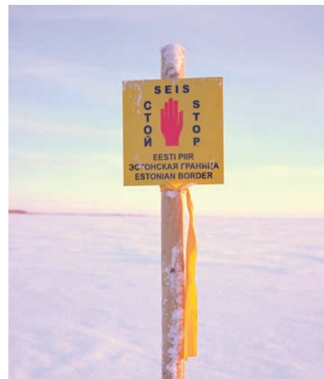
Sign on the Estonia-Russia boundary