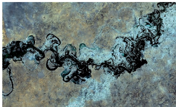
Satellite imagery reveals the complex geomorphology of the Komadugu Yobe river which forms part of the boundary between Nigeria and Niger (Landsat ETM+ image, 2000).

River boundaries are now a major focus of IBRU's research activities. A database containing information on more than 1,200 river boundary sections around the world will be published on the Unit's website later in 2008, along with an article in the journal Water Policy . In July we will also be repeating the successful training workshop first run in September 2005 on the theme 'River Boundaries: Practicalities & Solutions' (see page 3 for further details). Our long-term aim is to develop a toolkit to assist in the delimitation, demarcation and management of river boundaries, and we would encourage readers with practical experience of these activities to contribute to this project.