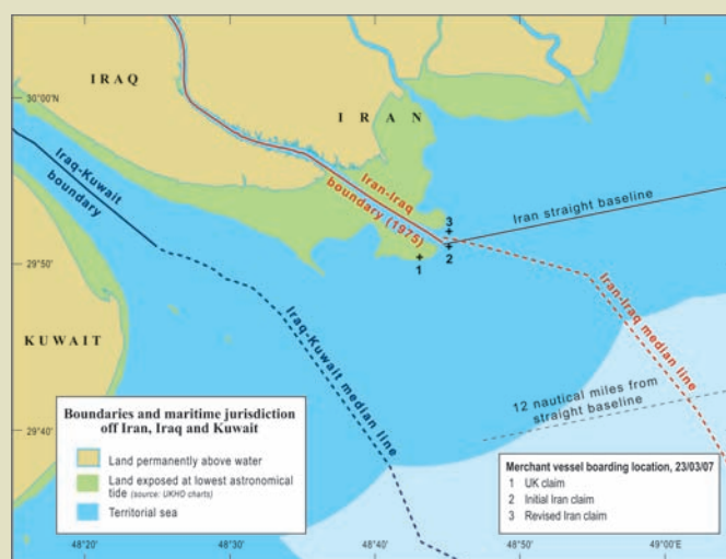
Claimed locations of the arrest of UK naval personnel at the mouth of the Shatt al Arab waterway in March 2007

accordance with the 2005 Judgment of the International Court of Justice. Meanwhile, the transfer of the Bakassi Peninsula from Nigeria to Cameroon (as required by a 2002 ICJ Judgment) continues to be a source of contention in Nigeria, with the senate ruling in December that the national constitution would have to be changed before the peninsula could be handed over.