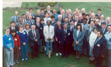
Participants in IBRU's first conference in September 1989

"We were credited with "a prescience unusual in academe" in launching IBRU, but in truth we had no idea that it would attract so much interest and become one of the foremost research centres of its kind."