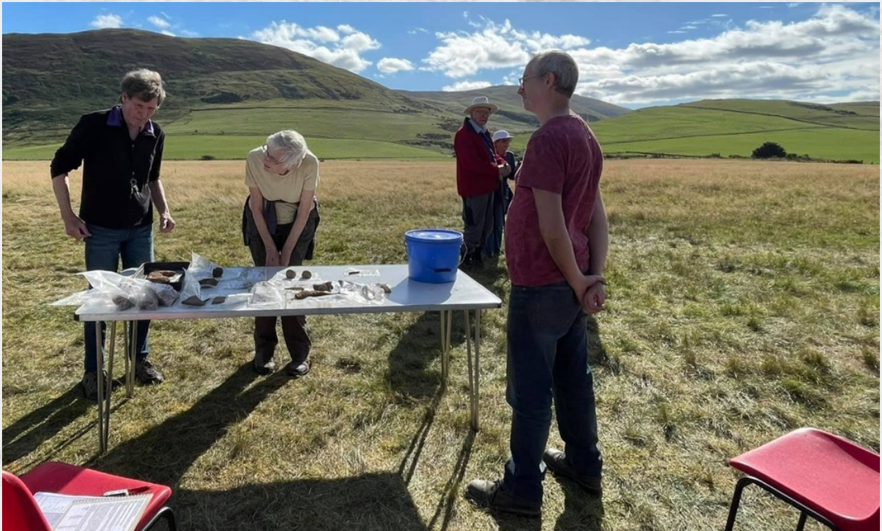
September 2021 - Community Open Day at the Yeavinger Excavation, Northumberland, UK