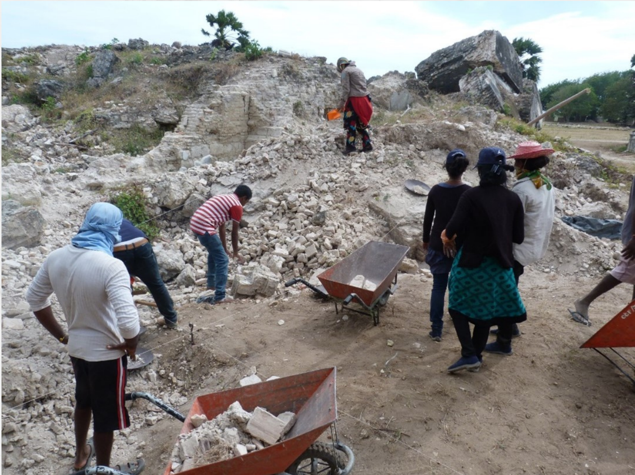
Post-disaster rescue excavations at the Krys Kerk, Jaffna Fort, Sri Lanka