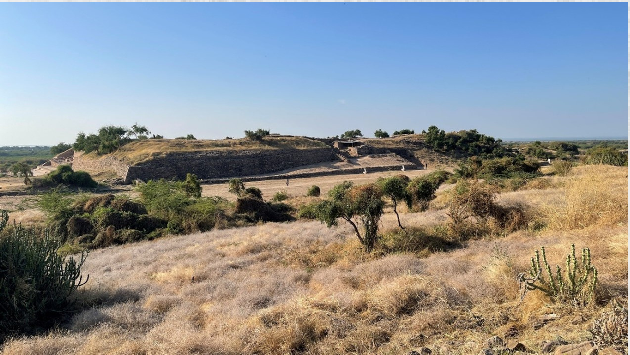
View of Castle from northeast with Ceremonial Ground and southern arm of Middle Town fortification in the foreground, Dholavira