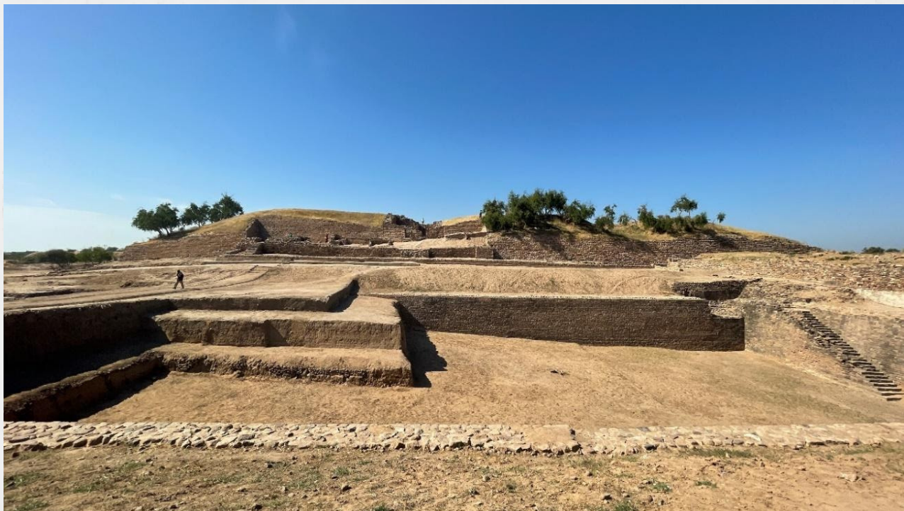
View of Castle from east with East Reservoir in the foreground, Dholavira