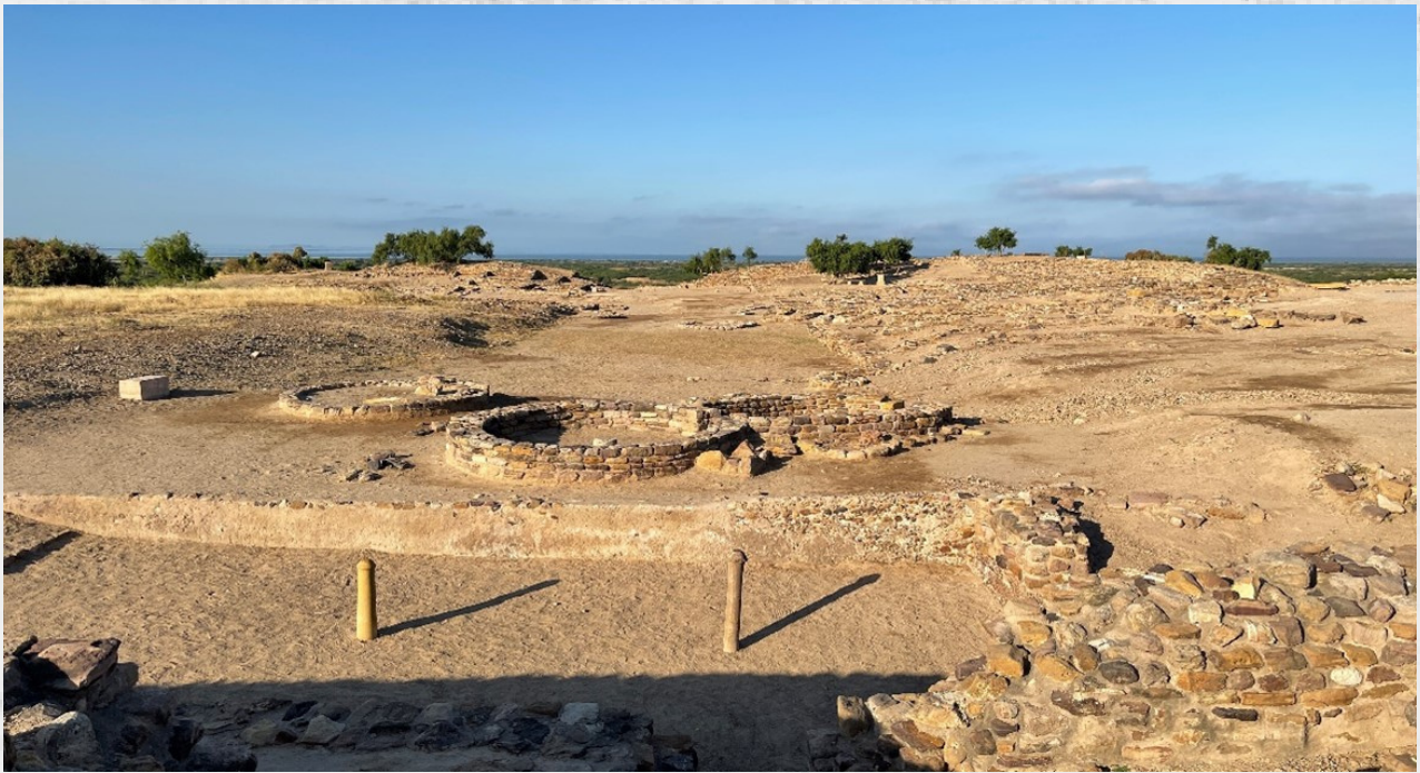
Central Broadway with structures of Stage VI and VII castle