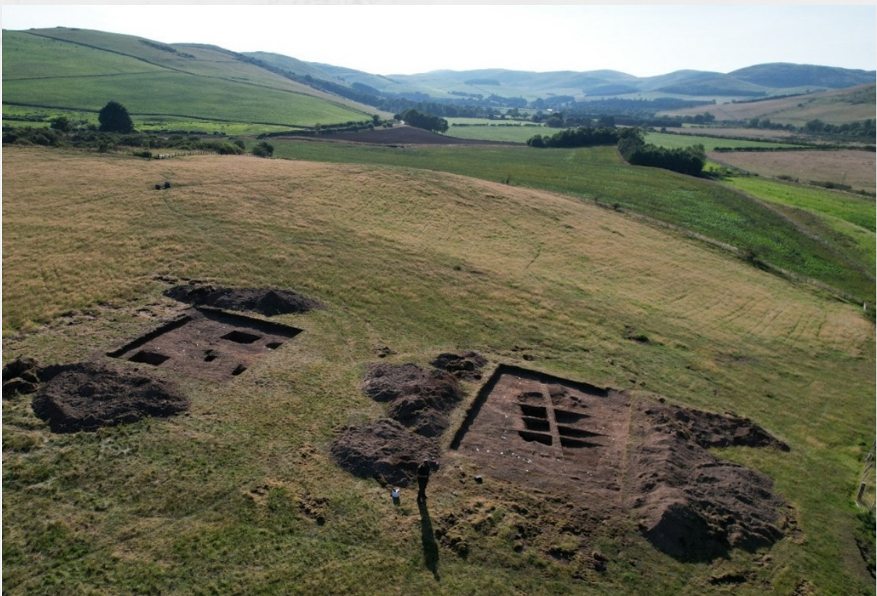
September 2021 Excavations at Yeavinger, palace site and royal centre for the 7th-century kingdom of Northumbria (Northumberland, UK)