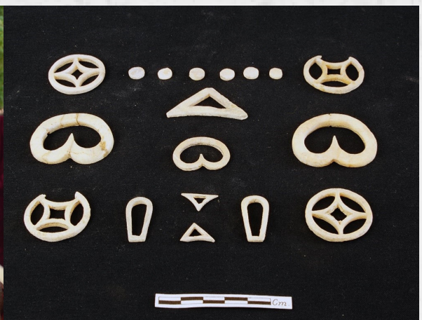
Shell artefacts and inlay work