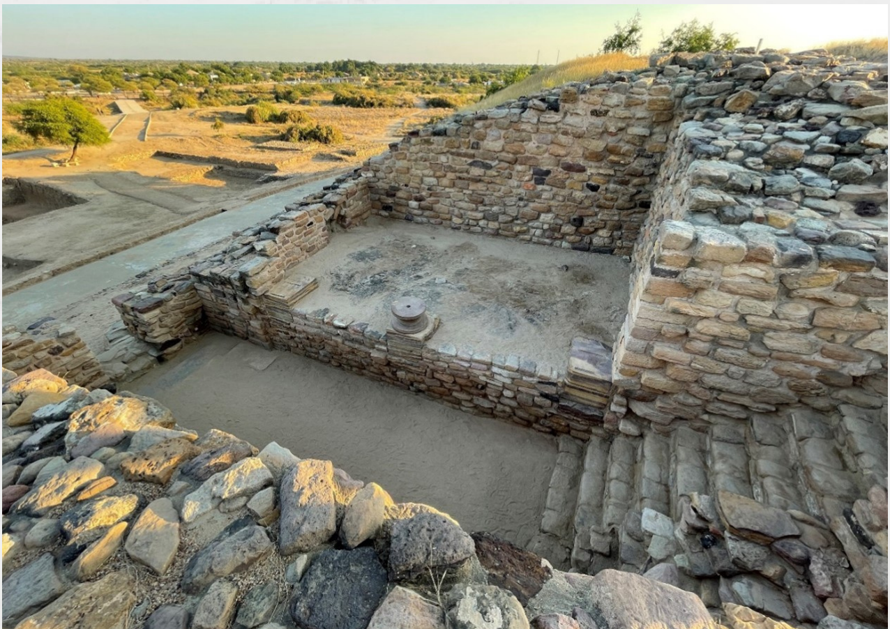
East Gate of Castle with the pillar members in situ, Dholavira