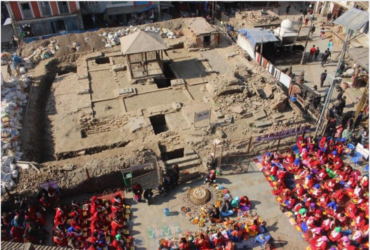
Post-earthquake rescue excavations at the Kasthamandap, Kathmandu, Nepal

In turn, this network initiated a GCRF-funded partnership with the Central Cultural Fund (Government of Sri Lanka) and the University of Jaffna to use our post-disaster experience to co-design new post-conflict methodologies to protect the war-damaged heritage of Jaffna and northern Sri Lanka.